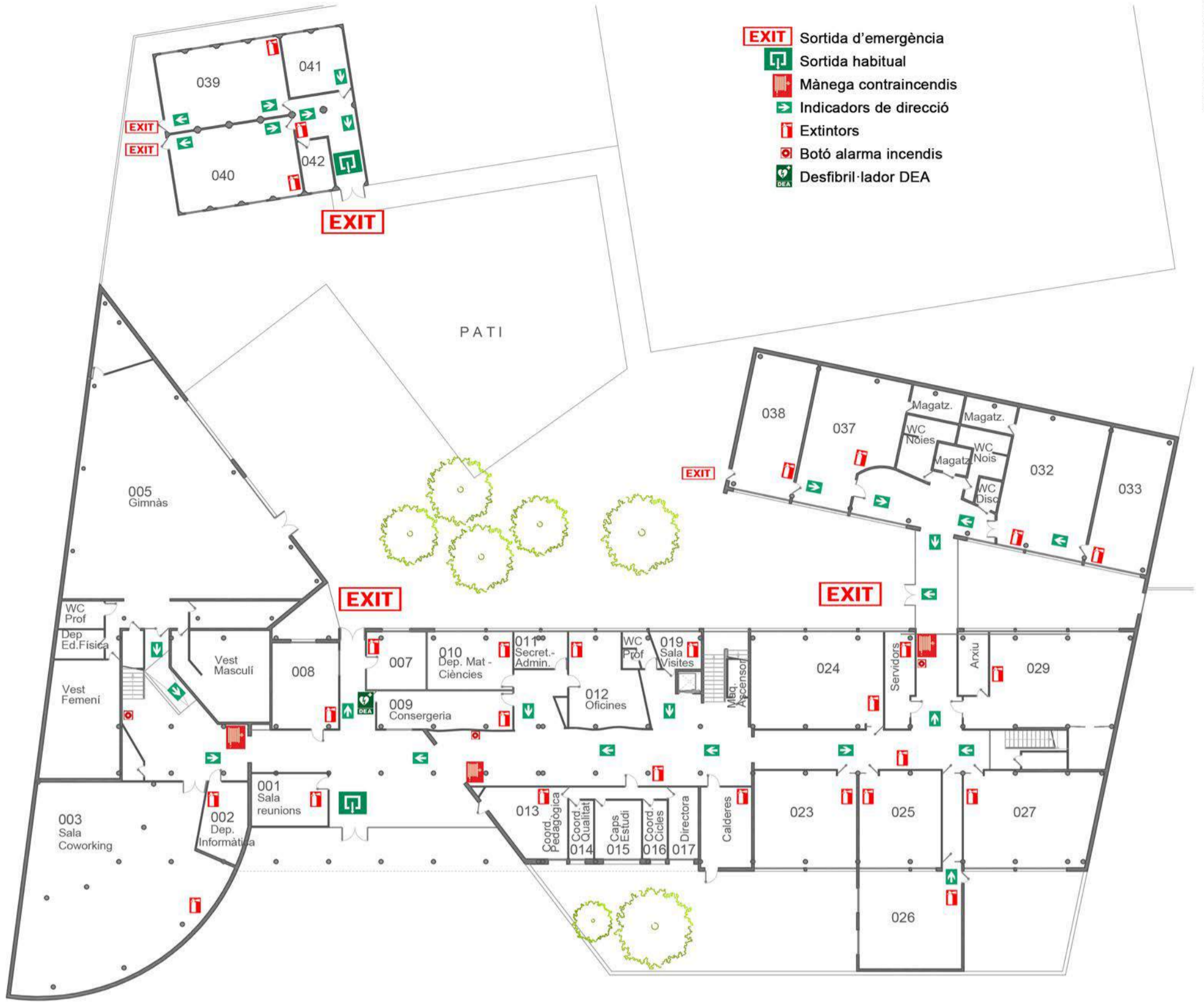
PLANTA BAIXA E=1/350